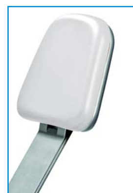
Elle / Elle 2

ELLE/Elle2 Fisso has only the movement along its vertical axis. ELLE/Elle2 Mobile is an anatomical headrest, characterized by movement of inclination of the upper part (double articulation) for a correct cervical support.